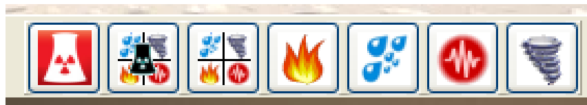
Figure 3. Example user-created macro buttons for integrated models

Integrated models in SAPHIRE may also be created where the event trees for different initiating events are created, and flag sets are used to specify which components are failed due to the initiating event, or conditions resulting from the initiating event (for example, if a fire in a room disables specific components in that room). Further, the analyses for different parts of the model can be run using the built-in macro system. Further, buttons that run macros for portions of the model, such as “Internal CDF Only,” “Internal and External CDF,” etc., can be created by the user to enable single-click analysis options (see Figure 3).